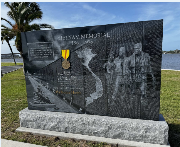
Vietnam Memorial Wall in Daytona Beach