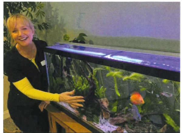
Aquarium created by KIM NOBLE