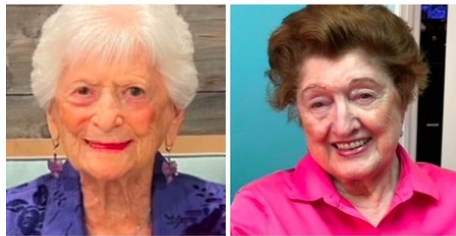
My New Year's resolution is to think only positive thoughts, obey my daughters, and continue to wish for a lasting peace - JEAN DOLEN Come for meals in the dining room earlier - JEAN DEXTER