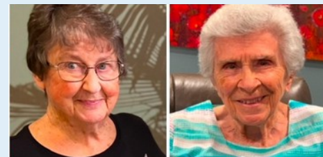
Be more thoughtful and kind to everyone - PAT LOVE My resolution is to never make resolutions because I break them - MARIE HELLAND