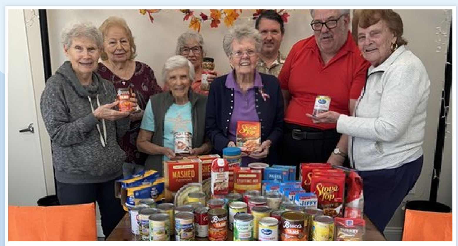
Thanksgiving feed the need food drive. Thanks to residents and staff who donated food items and helped to box them up for families in need.