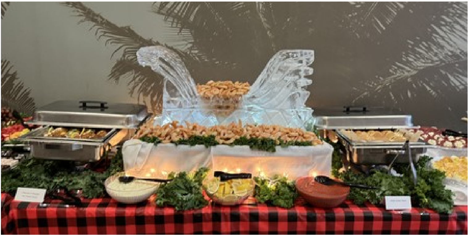
Executive Chef George Gaunt has elevated our culinary operations far beyond expectations. This lavish holiday party buffet was sumptuous and featured a magnificent ice sculpture sleigh he carved out of a block of ice overflowing with shrimp.