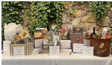
CSL "SILENT AUCTION" HAD GREAT ITEMS FOR BIDDING TO BENEFIT THIS WORTHY CAUSE.