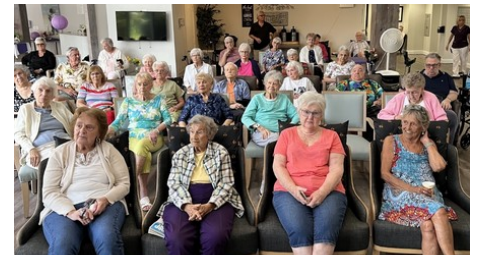
RESIDENTS ARE NOW FULLY TRAINED AND THEY ARE READY TO RUMBLE!