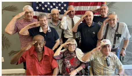
THE COUNTY SHERIFF AND OUR CSL VETERANS, ALL PROUD AMERICANS.