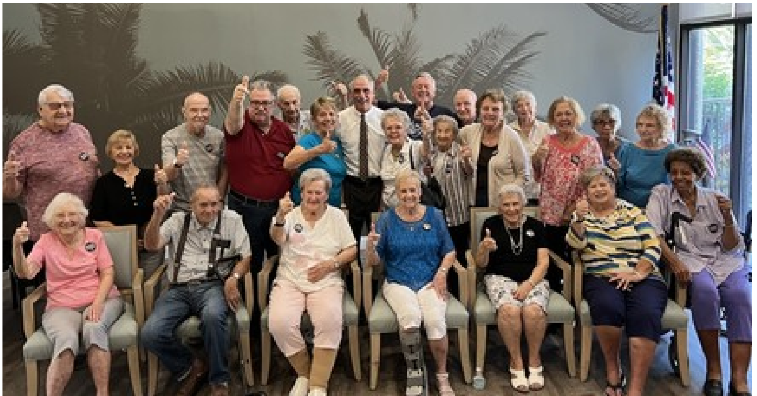
COUNTRYSIDE LAKES RESIDENTS RALLY AROUND THE IMMENSELY POPULAR VOLUSIA COUNTY SHERIFF MIKE CHITWOOD