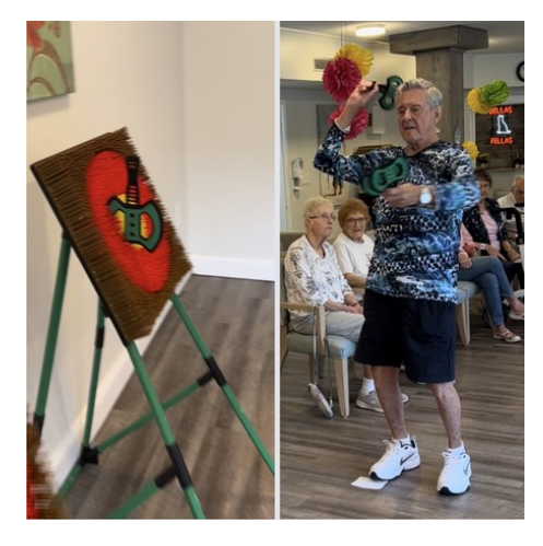
Our residents really know how to have fun at activities.